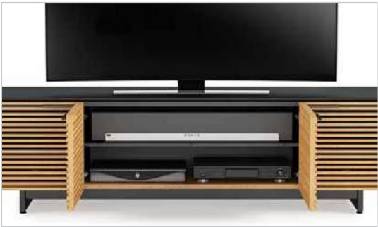
Center compartment accommodates a soundbar up to 38 in | 97 cm wide.